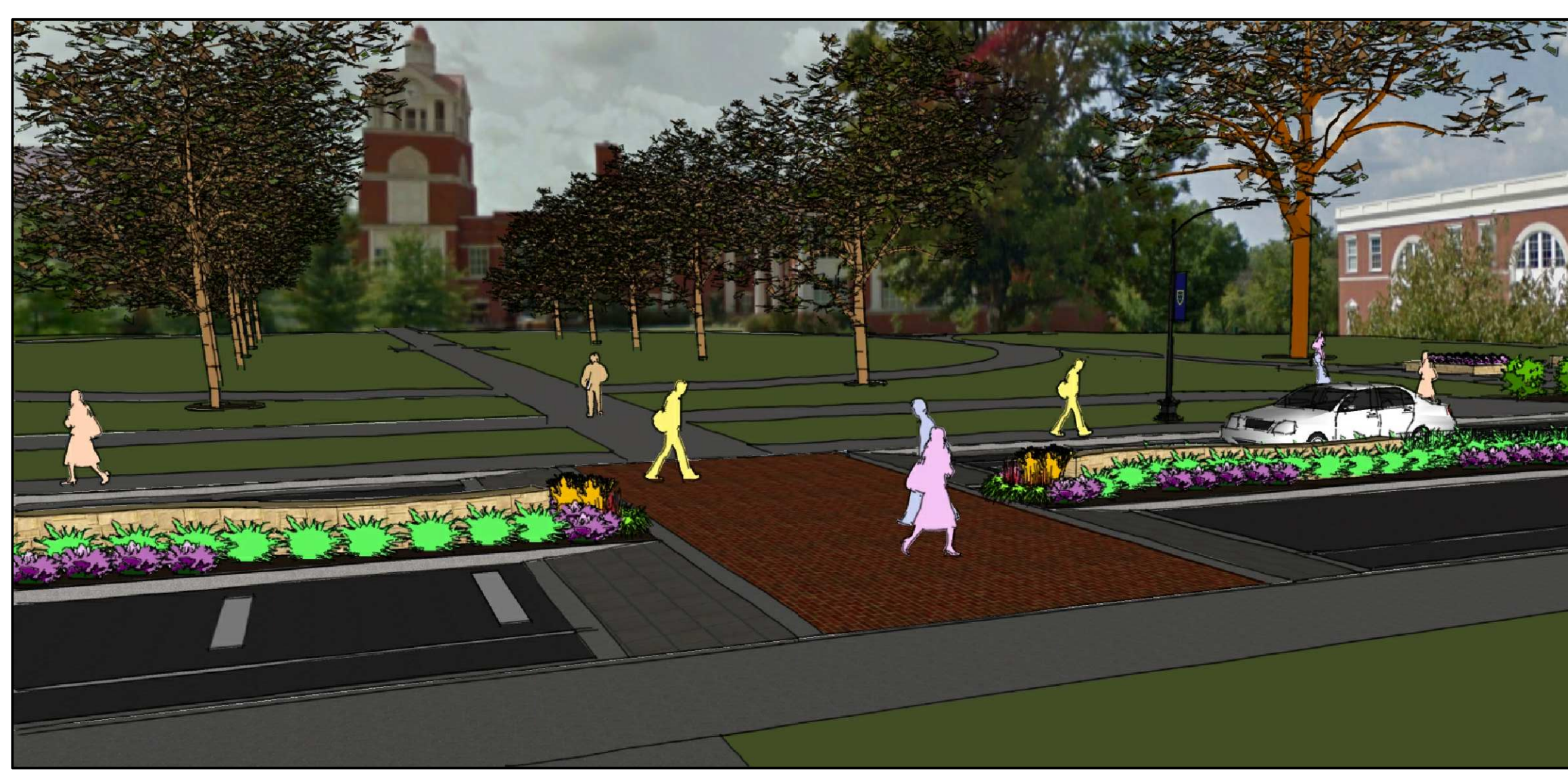
OVERALL VIEW OF SPEED TABLE CROSSING FACING WEST TOWARDS BIOLOGY BUILDING