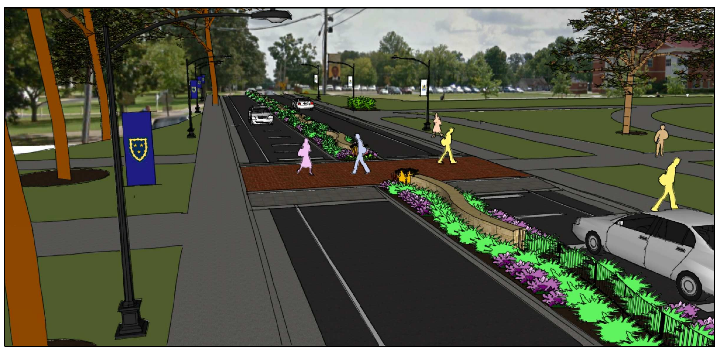
VIEW OF PEDESTRIAN CROSSING AND BARRIER FENCE AT INTERSECTION FACING SOUTH TOWARDS MAIN STREET