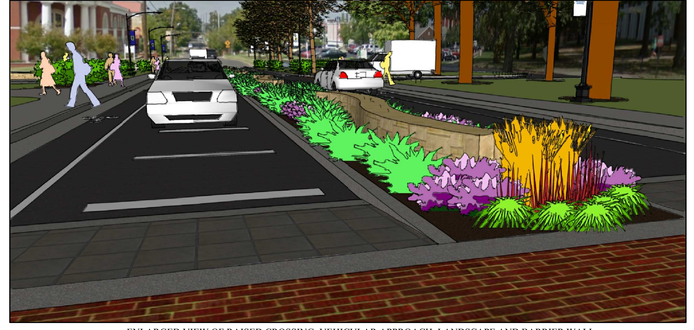
ENLARGED VIEW OF RAISED CROSSING, VEHICULAR APPROACH, LANDSCAPE AND BARRIER WALL FACING NORTH TOWARDS CHESTNUT STREET