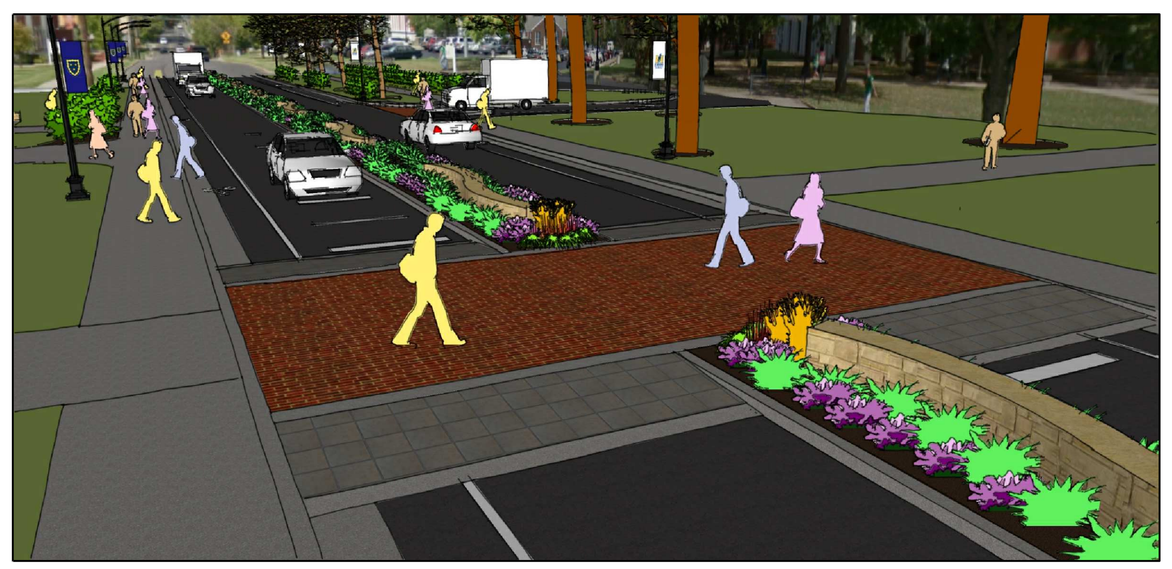
OVERALL VIEW OF SPEED TABLE CROSSING FACING NORTH TOWARDS RIGHT-IN/RIGHT-OUT INTERSECTION AND CHESTNUT STREET