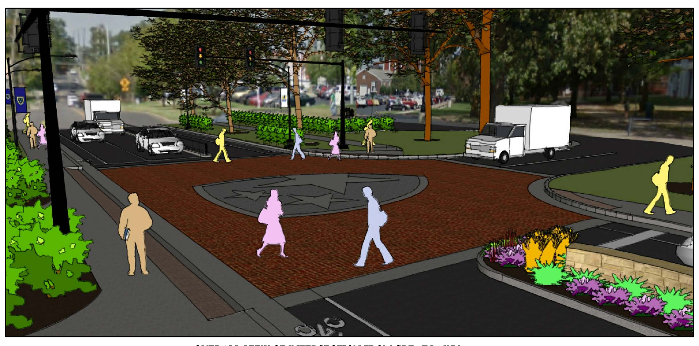
OVERALL VIEW OF INTERSECTION FROM GREAT LAWN FACING NORTHEAST TOWARDS VISUAL ARTS BUILDING