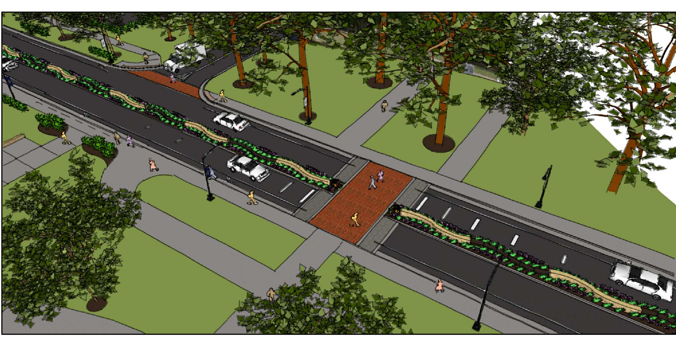
OVERALL VIEW OF INTERSECTION FROM PARKING LOT FACING WEST TOWARDS GREAT LAWN AT BIOLOGY BUILDING