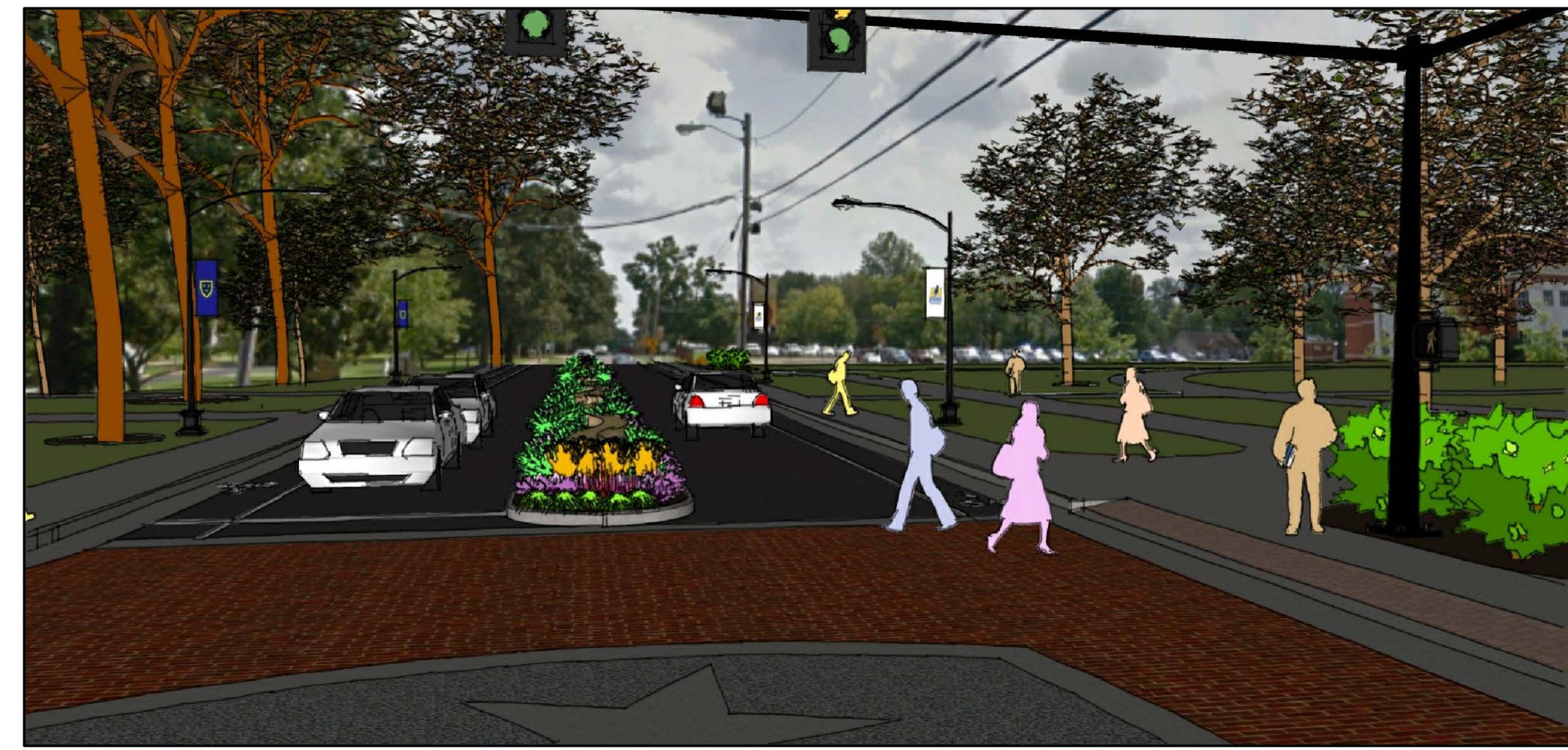
VIEW OF INTERSECTION INCLUDING LANDSCAPE MEDIAN, PEDESTRIAN BARRIER FENCE, AND WALL FACING SOUTH TOWARDS MAIN STREET