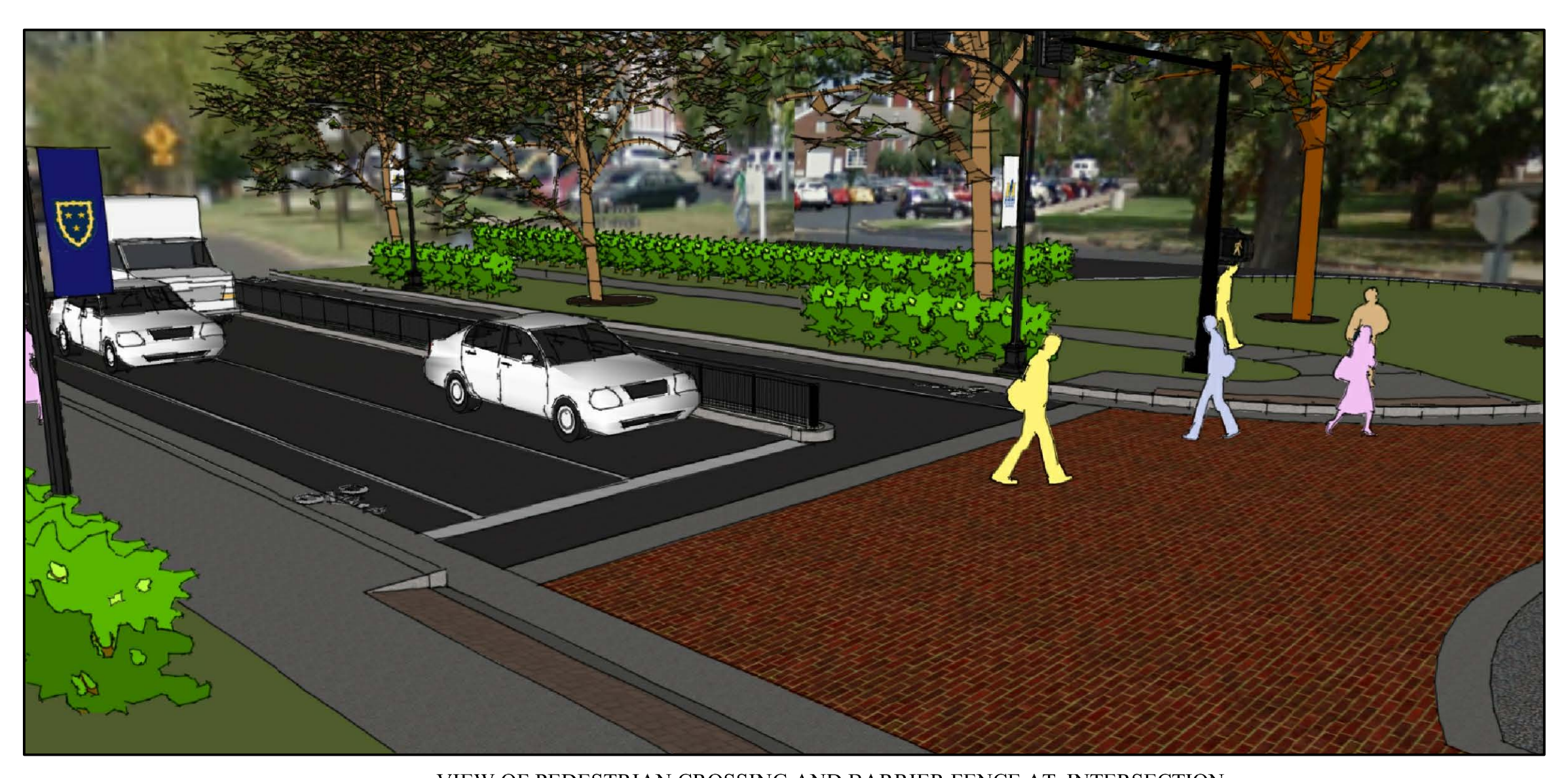
VIEW OF PEDESTRIAN CROSSING AND BARRIER FENCE AT INTERSECTION FACING NORTHEAST TOWARDS VISUAL ARTS BUILDING