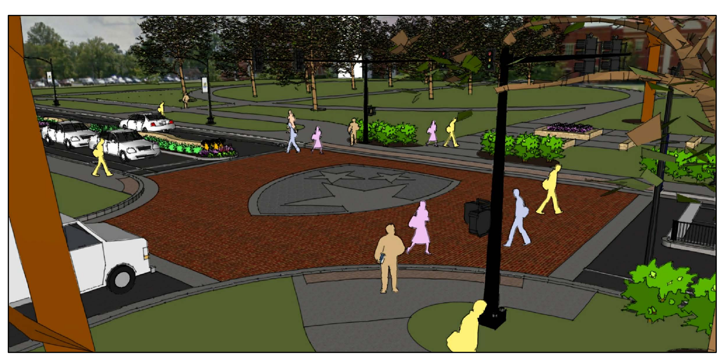
OVERALL VIEW OF INTERSECTION FROM PARKING LOT FACING WEST TOWARDS GREAT LAWN AT BIOLOGY BUILDING