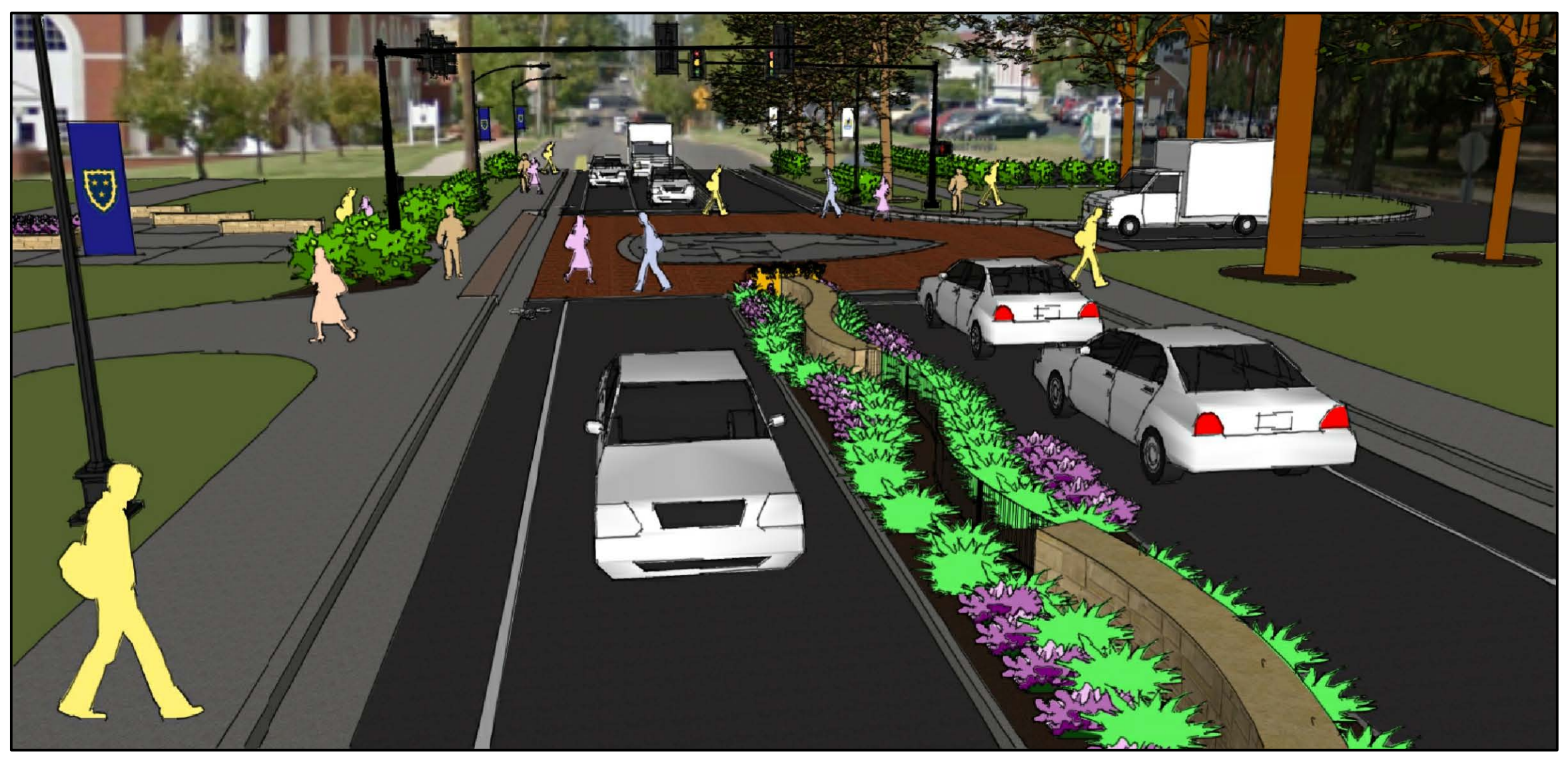
VIEW OF LANDSCAPE MEDIAN WITH PEDESTRIAN BARRIER FENCE & WALL FACING NORTH TOWARDS CHESTNUT STREET

SIGNALIZED INTERSECTION RENDERING 16TH STREET AT PARKING LOT ENTRANCE ACROSS FROM ALEXANDER HALL